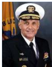
Richard Carmona, MD

The Alliance is also pleased to announce that Richard H. Carmona, M.D., M.P.H., FACS, will serve as Health and Wellness Chairperson of the Alliance. Dr. Carmona was the 17th U.S. Surgeon General (2002-2006), and is vice chairman of Canyon Ranch, president of the non-profit Canyon Ranch Institute, and distinguished professor at the Mel and Enid Zuckerman College of Public Health at the University of Arizona.