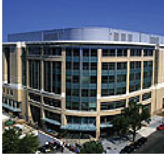
The George Washington University Hospital

Each resident will be assigned a mentor who will meet with the resident on a monthly basis to provide supervision, monitor and evaluate performance and provide a written annual progress report to the IMP and GME offices. The mentor will be responsible for communicating any potential problem with the resident to GME and IMP. All correspondence with the sponsor must go through the IMP office. The mentor must obtain prior approval from GME and IMP to communicate with sponsoring entities directly.