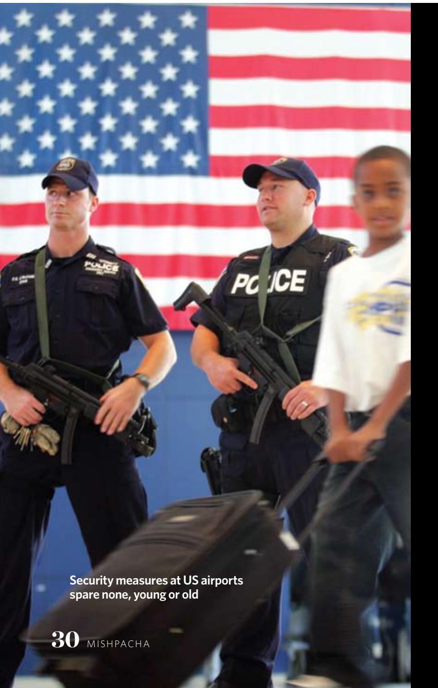
Security measures at US airports spare none, young or old

In a nation as vast, bustling, and free as the United States, implementing the infrastructure on the home front to adequately protect its 310 million citizens against terrorism is a tall order that repeatedly comes up short.